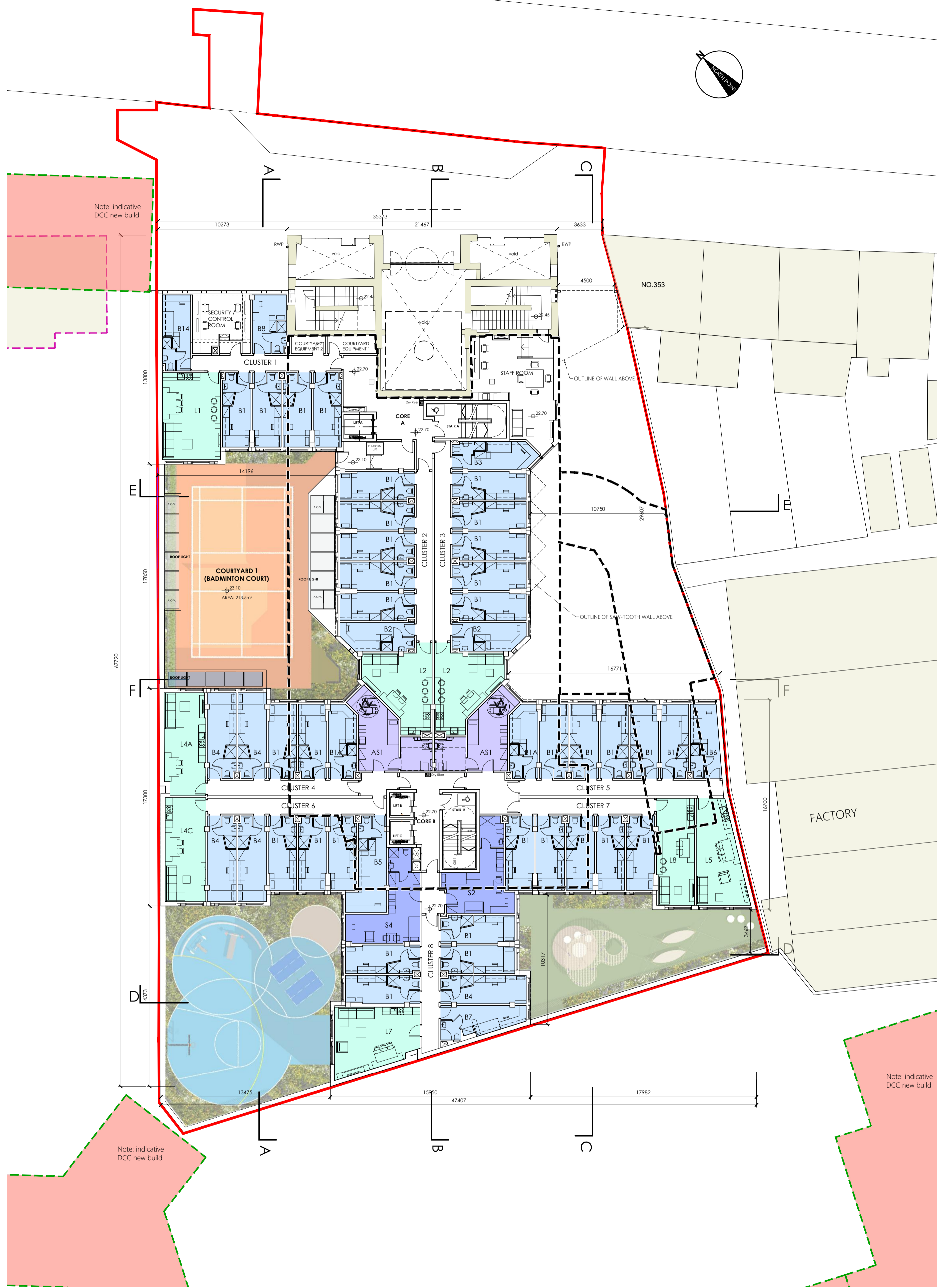
① FIRST FLOOR PLAN (LEVEL 1) SCALE 1:200